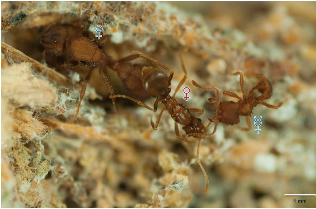
Figure 1. A Queen of the Socially Parasitic Mycocepurus castrator Interacts with Its Host M. goeldii

The social parasite (center) is antennated by a worker (right) while standing on the host queen (left). Note the significant size difference between parasite and host queens. The scale bar represents 1 mm.