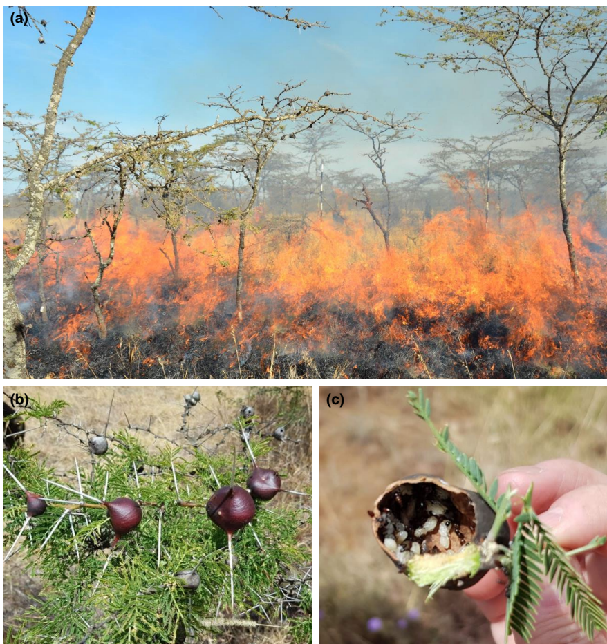
FIGURE 1 The ant-acacia symbiosis. (a) Vachellia drepanolobium being burned in a controlled fire in the Kenya Long-Term Exclusion Experiment plots, at the Mpala Research Centre in Laikipia, Kenya. (b) The swollen stipular thorns form 'domatia' that house the defensive ant symbionts and provide further defense against herbivores. (c) An opened domatium. At Mpala, four symbiotic ant species coexist in the landscape (though rarely within individual trees): Crematogaster mimosae , Crematogaster nigriceps , Tetraponera penzigi , and Crematogaster sjostedti . Trees used for this experiment at the Harvard Museum of Comparative Zoology greenhouse did not house ants.

livestock, and planting crops (Marchant, 2010; Martins de Melo & Saito, 2012; Silva et al., 2006), in more recent decades, fire suppression and increased grazing are shifting the balance in favor of trees (Stevens et al., 2016; Venter et al., 2018). This woody encroachment is a land management challenge, resulting in reduced forage for livestock and augmentation of tick populations (Negasa et al., 2014) and shifting landscape-scale biogeochemistry and hydrology (Asner et al., 2004). Both the balance of vegetation types (Hagos & Smit, 2005) and fire frequency (Jensen et al., 2001; Wan et al., 2001) influence savanna nutrient dynamics, with implications for ecological stability and human use (Venter et al., 2017).